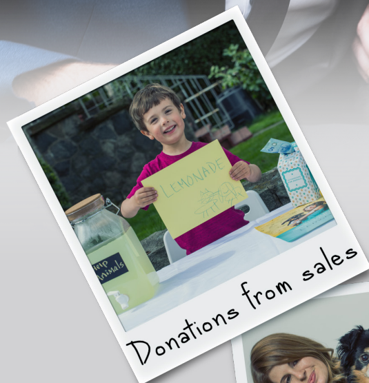
Donations from sales