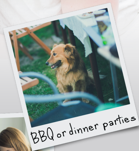
BBQ or dinner parties