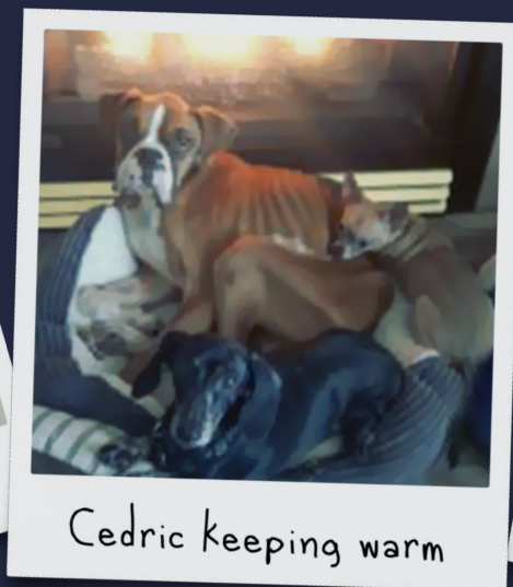
Cedric keeping warm