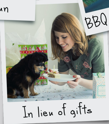
In lieu of gifts